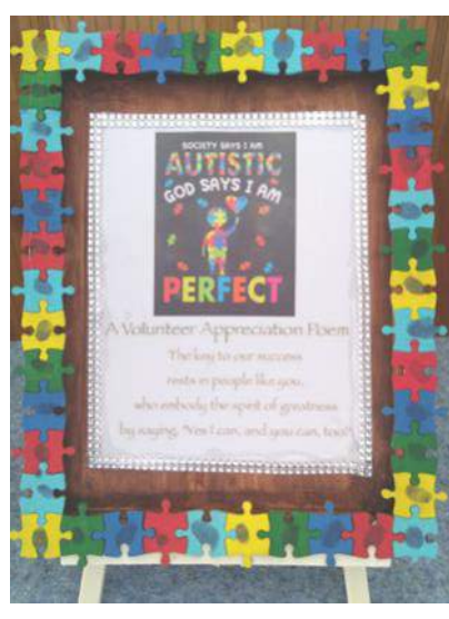
Each puzzle piece has one of the student's Finger Prints. It is currently on the Welcome Center

presented this student framed certificate to our congregation to say, "'Thank you' for your support of our school!"