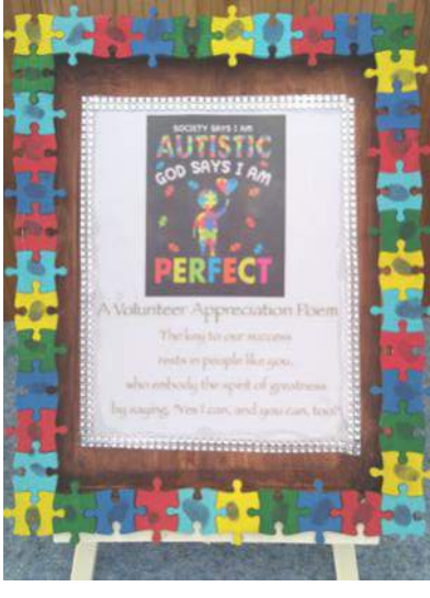
Each puzzle piece has one of the student's Finger Prints. It is currently on the Welcome Center

presented this student framed certificate to our congregation on Friday to say, "'Thank you' for your support of our school!"